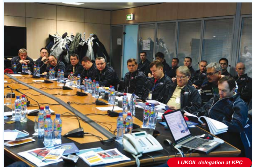
LUKOIL delegation at KPC

The delegation was impressed by the current performance of Karachaganak and paid tribute to the KPO team for their efforts. During the visit, the delegation also met with LUKOIL representatives working at KPO.